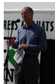
The Lord Mayor